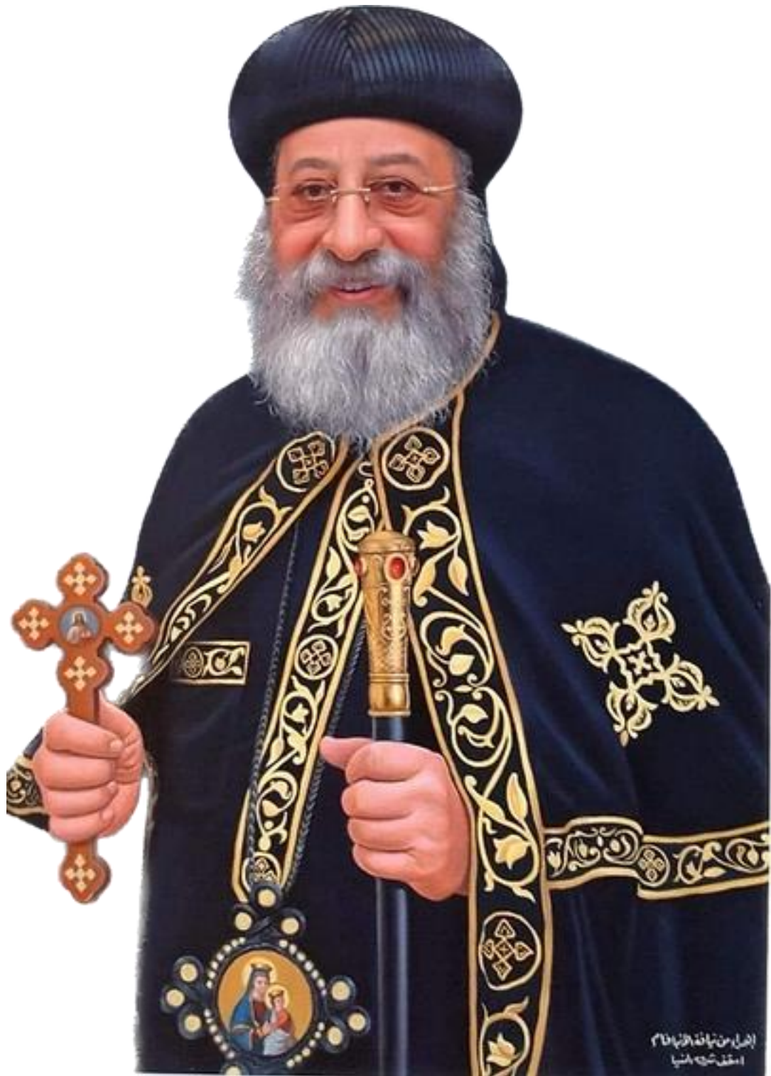
His Holiness Pope Tawadros II 118 th Pope of Alexandria and Patriarch of the See of St. Mark