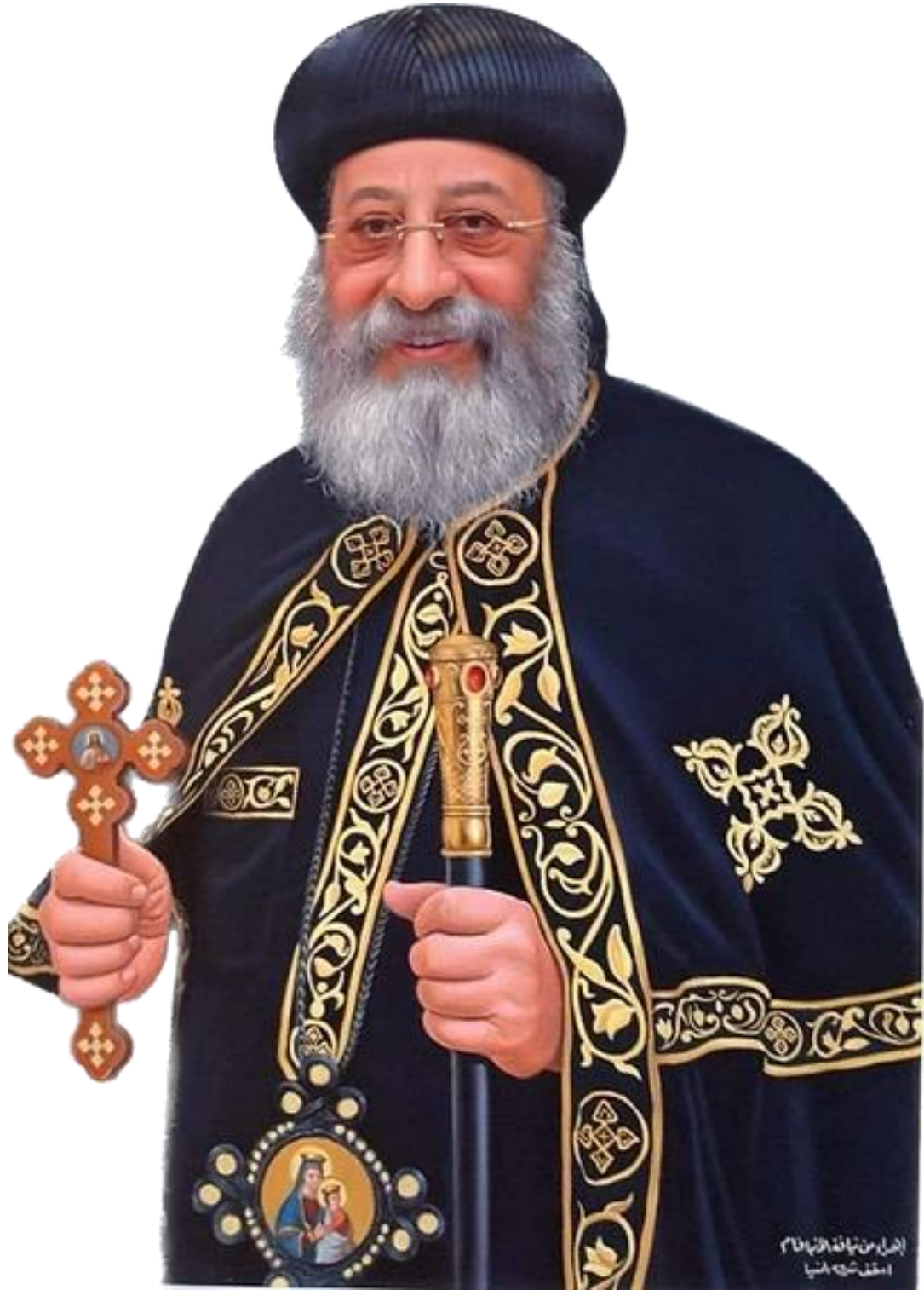
His Holiness Pope Tawadros II 118 th Pope of Alexandria and Patriarch of the See of St. Mark